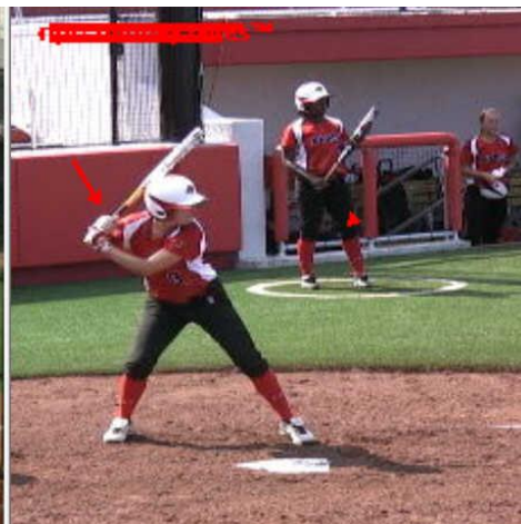
Hands equal to elbow