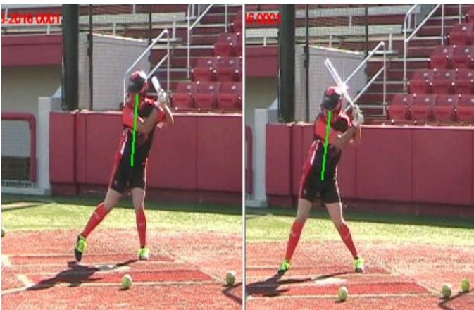
Backward Stuck posture