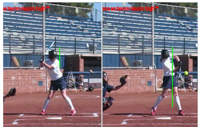
Drifting vs Stay back rotation

Hitting begins with a linear movement towards the pitcher, but when the hands start forward, the swing becomes rotational. Drifting weight towards the pitcher during rotation will reduce power.