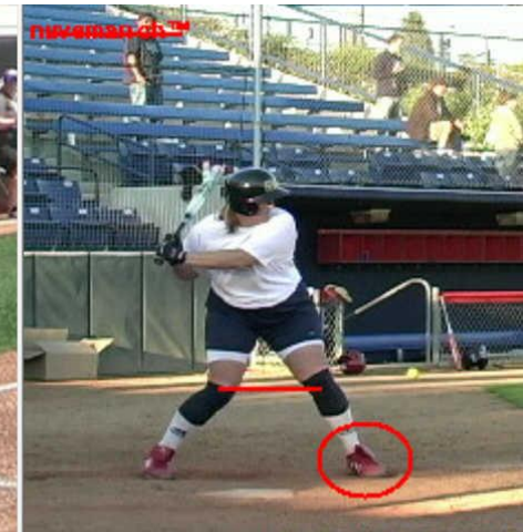
Stable, Athletic Base