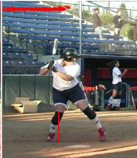
Balanced negative move