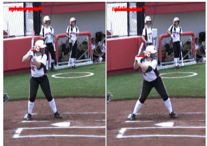
Dead Hands vs Live & Independent Hands

More often the best hitters' move or "stretch" their hands away from the head when beginning a positive move. When the hands are "live and independently moving," they are quicker to make the first move and adjust to locations. "Dead hands" drift with forward movement and can reduce power.