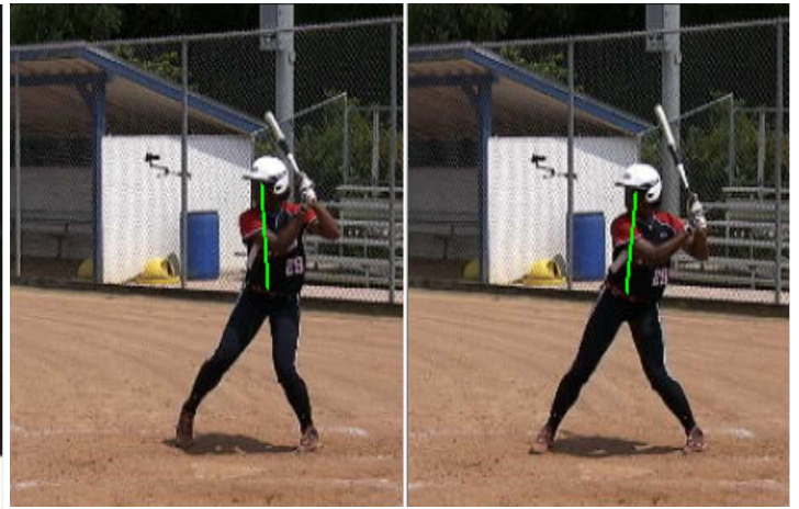
Changing Posture: Forward to backward