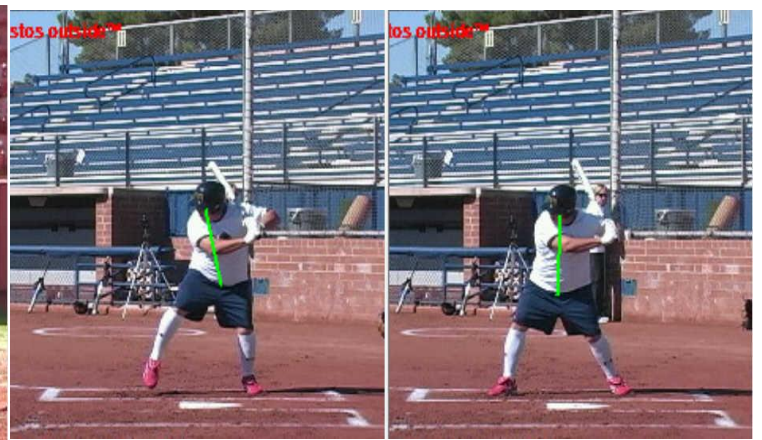
Changing Posture: Forward to backward

As the hitter begins her negative move, she needs to have forward posture (inside eye ahead of the belt buckle). But as the positive move begins, the hitter's posture should begin changing from forward to backward (inside eye behind the belt buckle). Posture that doesn't go from forward to backward will reduce the ability to make solid contact as well as reduce power.