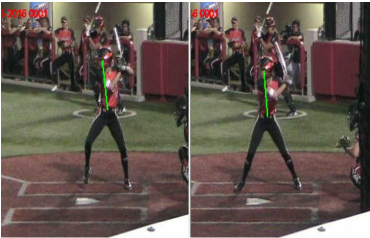
Forward stuck Posture